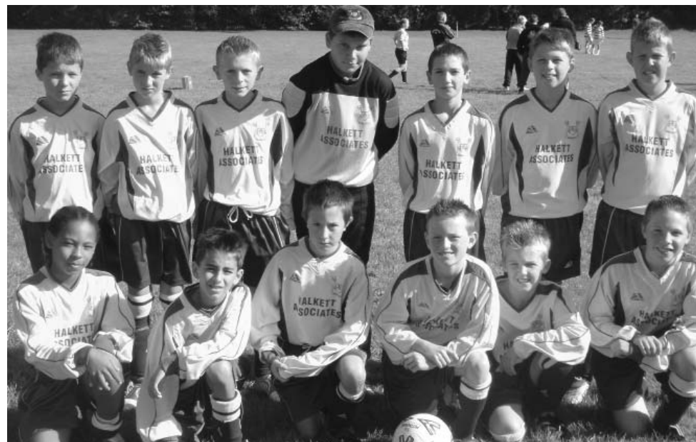
Brinklow under 12's proudly wearing their new kit kindly sponsored by Halkett Associates Ltd