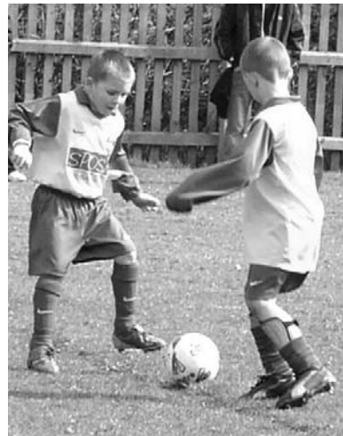
u8's kick off!!