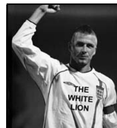
'THE WHITE LION' Englands next shirt sponsors?